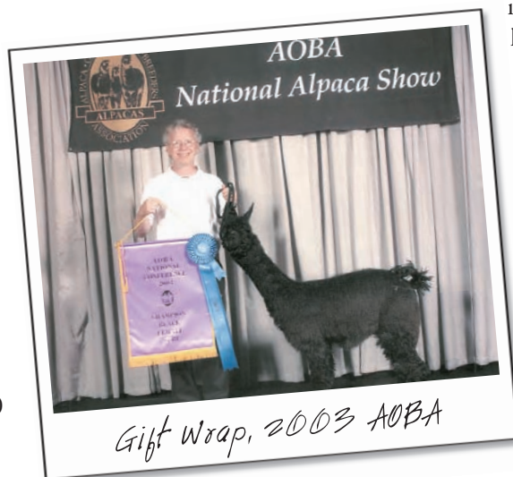
Gift Wrap, 2003 AOBA

We have always been interested in what the show ring can tell us about the results of our breeding program. It has been rewarding, as we have raised and shown Color Champions, class winners, and Top Five Champions at the 2001, 2003, 2004, 2005, and 2006 AOBA shows. The True Black 2003 Suri Color Champion, Gift Wrap, was sold to the late Craig Aurness for $50,000.