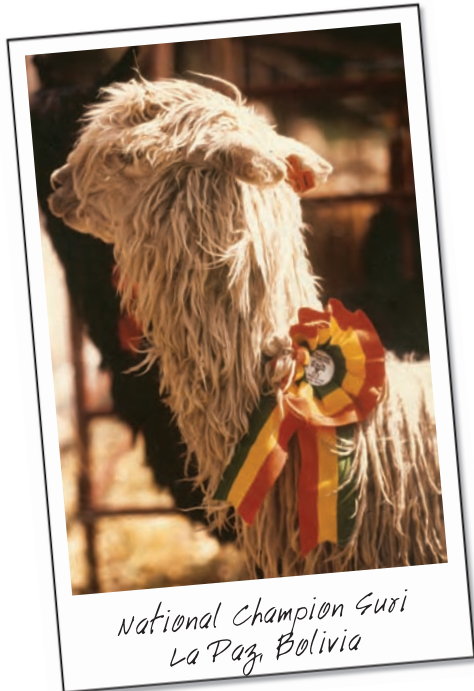
National Champion Suri La Paz, Bolivia

This special week-end is your once-in-a-lifetime opportunity to own the stock we have worked for over three decades to produce. There will be only one "Lifetime Achievement" sale.