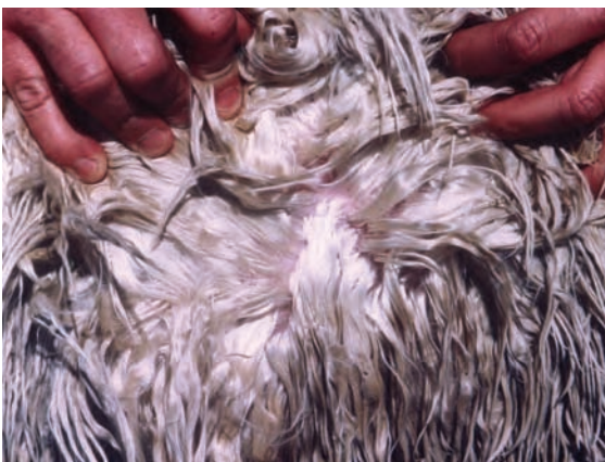
Parting fleece with luster