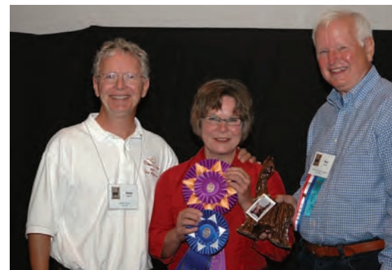
Happy Customers, Grand Champion Fleece